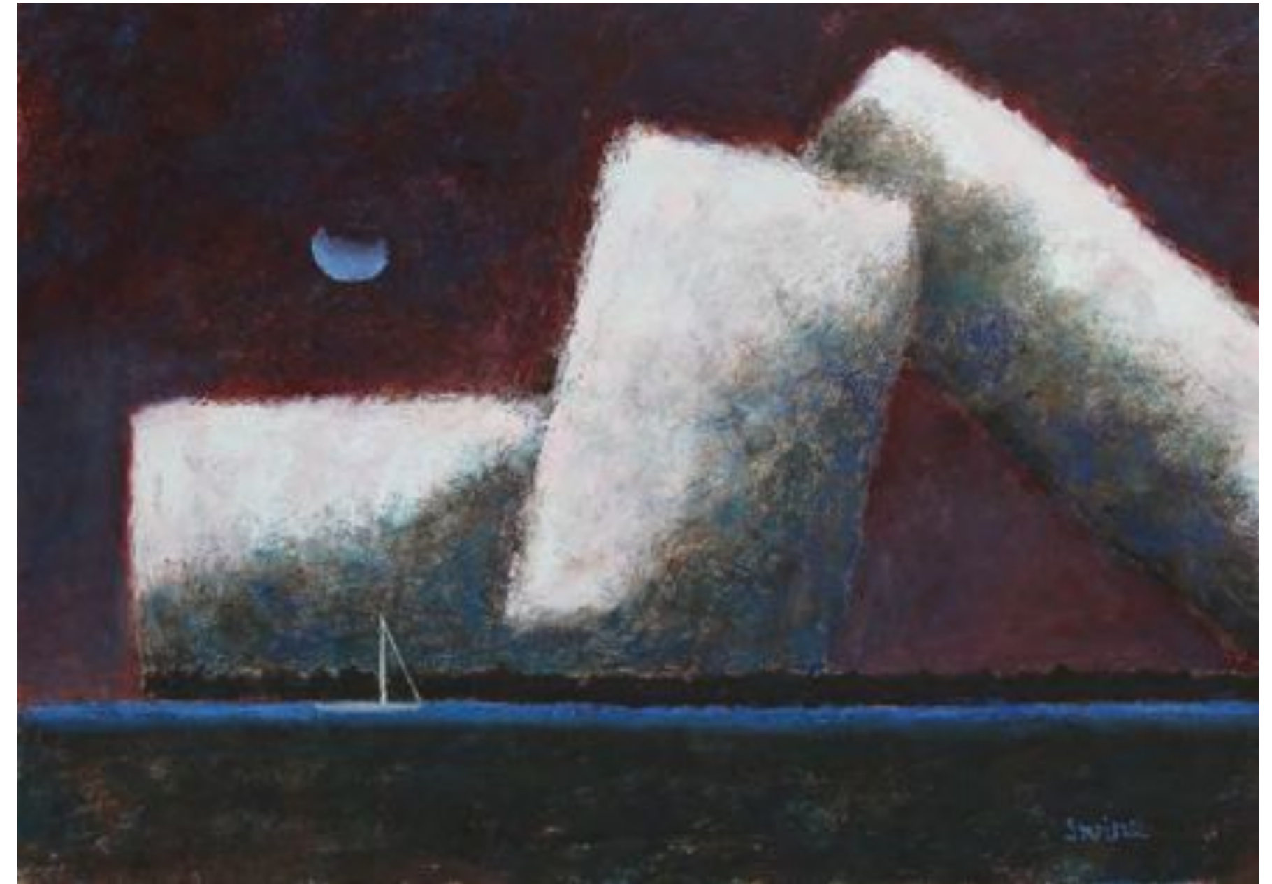
Blue Moon over Tinkers Oil on board, 26 x 36 inches, 2014. Collection of the artist.