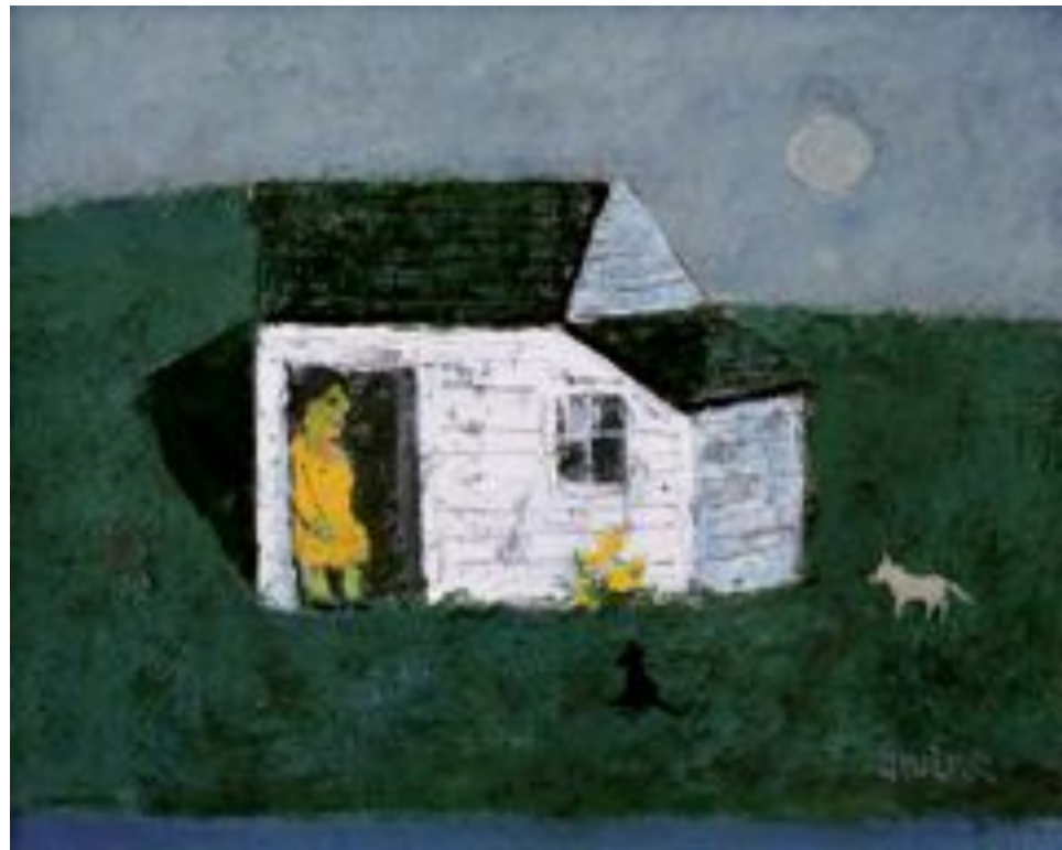
Hanging the Wash Oil on board, 16 x 20 inches, 2009. Private collection.