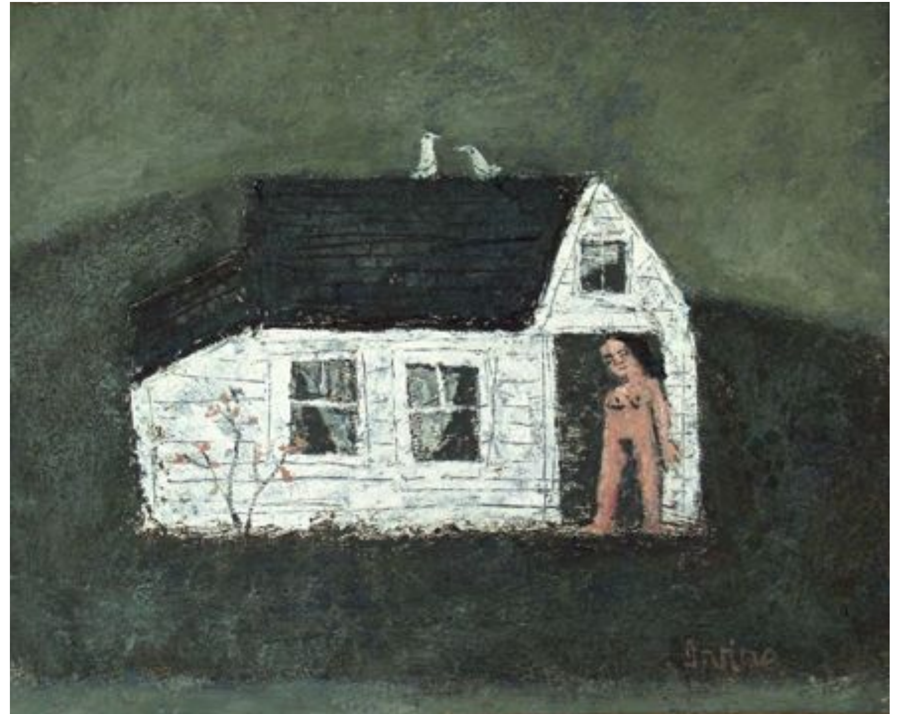
October Nude Oil on board, 16 x 20 inches, 2013. Collection Norma Marin.