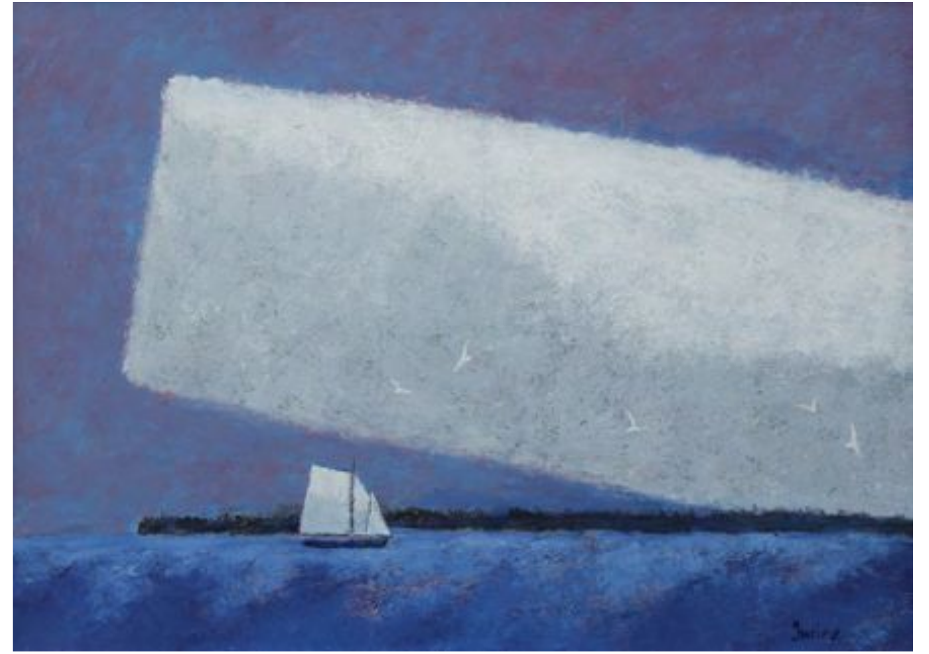
The White Cloud Oil on board, 26 x 36 inches, 2014. Collection of the artist.