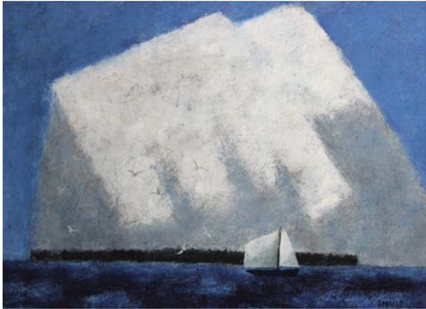
Clouds Breaking over Tinkers Oil on board, 26 x 36 inches, 2014. Collection of the artist.