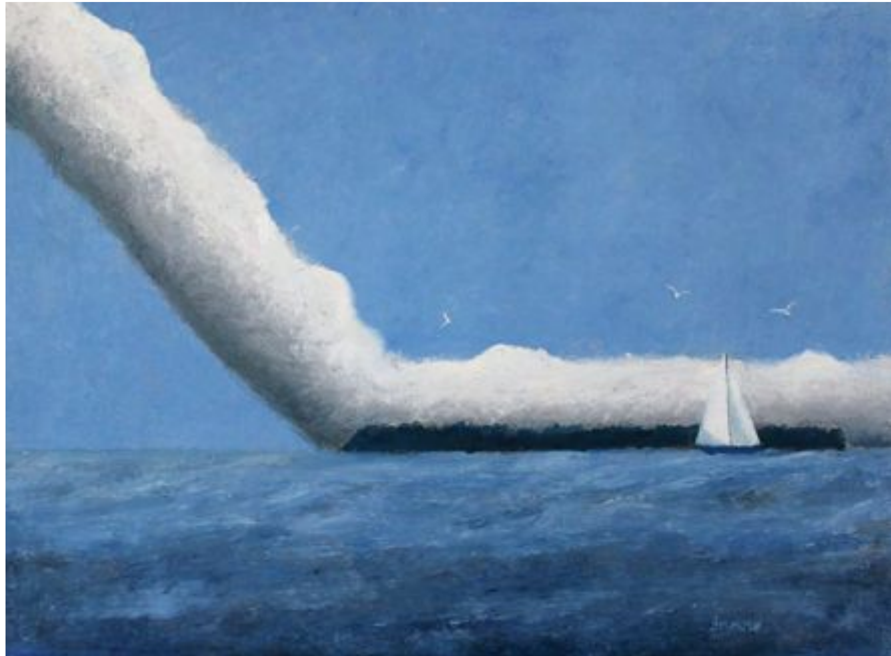
The Long Cloud Oil on canvas, 36 x 40 inches, 2014. Collection of the artist.