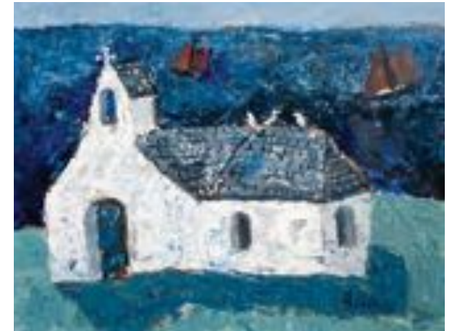
Low Tide, Blue Hill Bay Oil on board, 26 x 36 inches, 2001. Private collection.