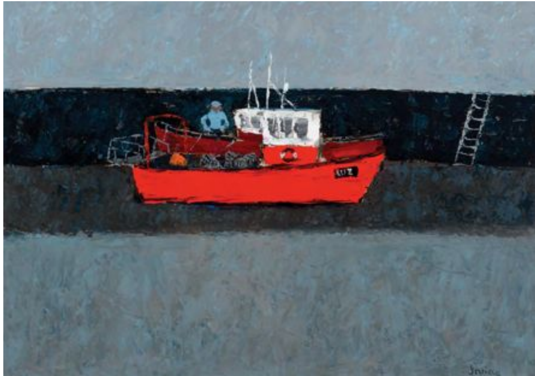
Two Fishing Boats Oil on canvas, 30 x 36 inches, 2001. Private collection.