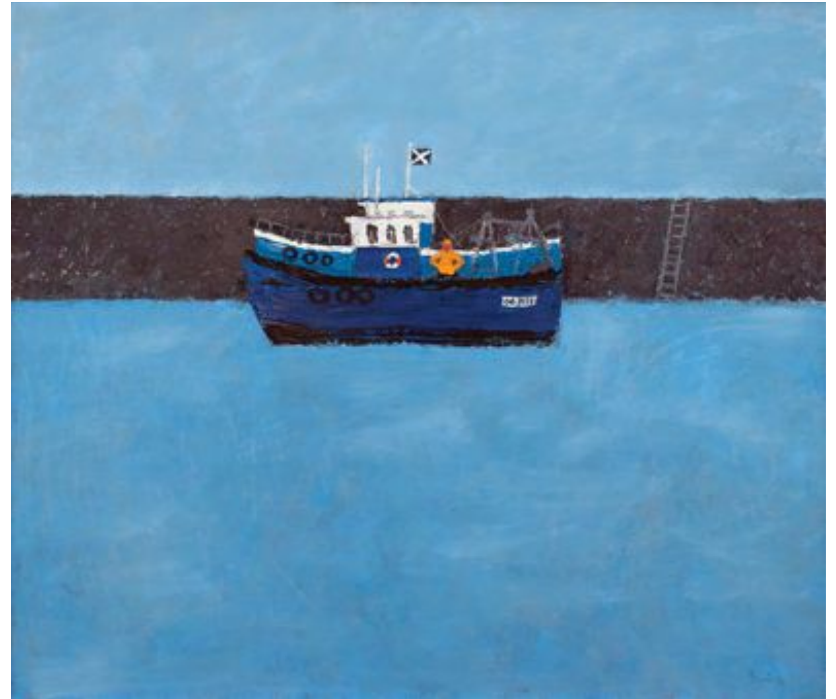
Big Blue Oil on board, 48 x 48 inches, 2004. Private collection.