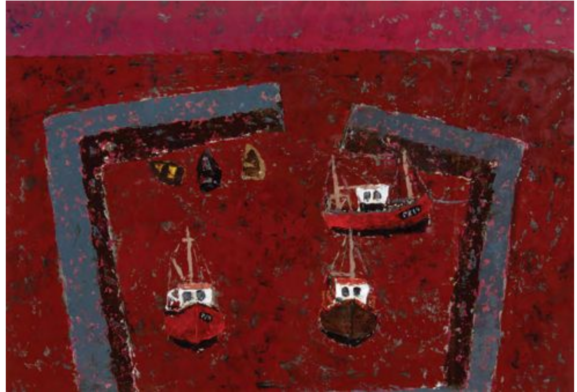
OPPOSITE Red Harbor Oil on board, 28 x 36 inches, 2000. Private collection.